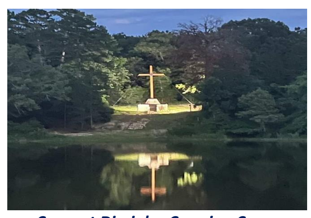
Cross at Disciples Crossing Camp