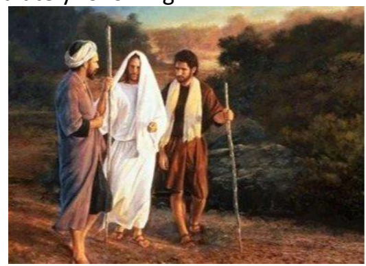
Walk to Emmaus, Luke 24:13-35

<u>Sat, Apr 20, FMC Gladewater</u> – Gathering potluck lunch at noon, with service immediately following.